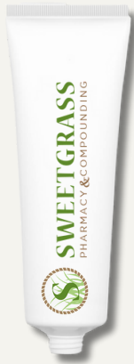
TRETINOIN CREAM (STRENGTH VARIES BY PATIENT NEED) 45 GM $56