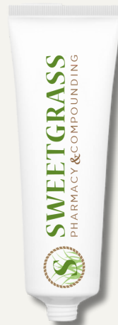
CLOTRIMAZOLE 1%/ TRIAMCINOLONE 1% CREAM 30 GM $56