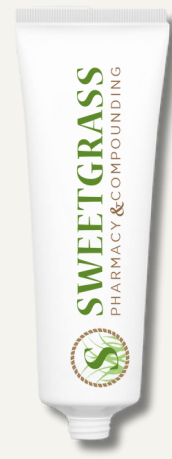
IVERMECTIN LOTION 1.5% 30 GM $56