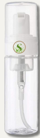
AZELAIC ACID 15%/ NIACINAMIDE 4% FOAM 30 GM $75