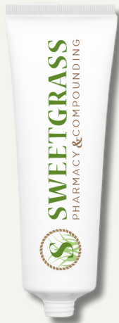
SPOT TREATMENT- CLOBETASOL 0.05%/TRETINOIN 0.025%/ SPIRONOLACTONE 5% GEL 15 GM $40