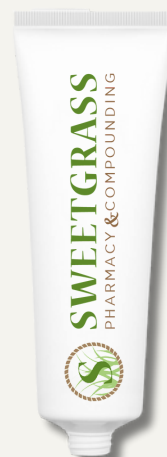
TRANEXAMIC ACID 5% CREAM 120 GM $56

*COMPOUNDS ARE CUSTOMIZABLE AND MAY VARY BY STRENGTH OR BASE. AVAILABLE BASES INCLUDE: