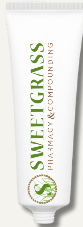
IDOQUINOL 1%/HYDROCORTISONE 0.05% CREAM 30 GM $56