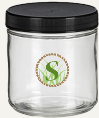
CLINDAMYCIN 1% CLEANSING PAD 30 PADS $60