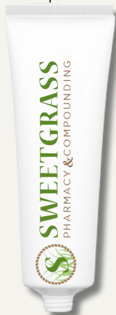
BRUISE CREAM IN W06 ANHYDROUS GEL 30 GM $60