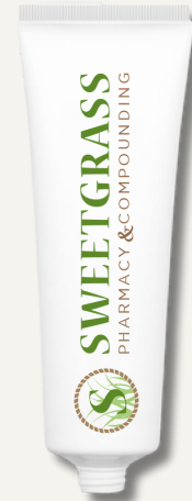
UREA 40%CREAM 120 GM $56